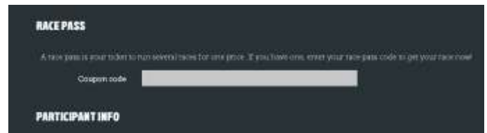
Figure 1: Race pass code, this is NOT where you enter your code